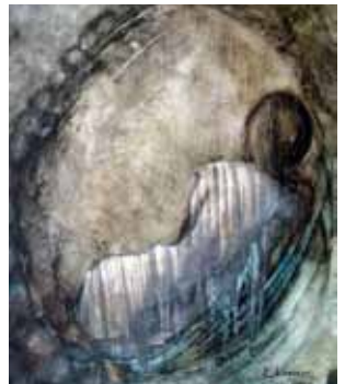
“Painting in veils” technique

This course is for the beginner through intermediate figure drawing student. The instructor will reinforce basic figure drawing fundamentals, drawing from the live model, while embracing each student's own drawing style. Students may also keep a sketchbook/ drawing journal, and participate in an interactive review of their work with the instructor. A basic supply list will be provided upon registration.